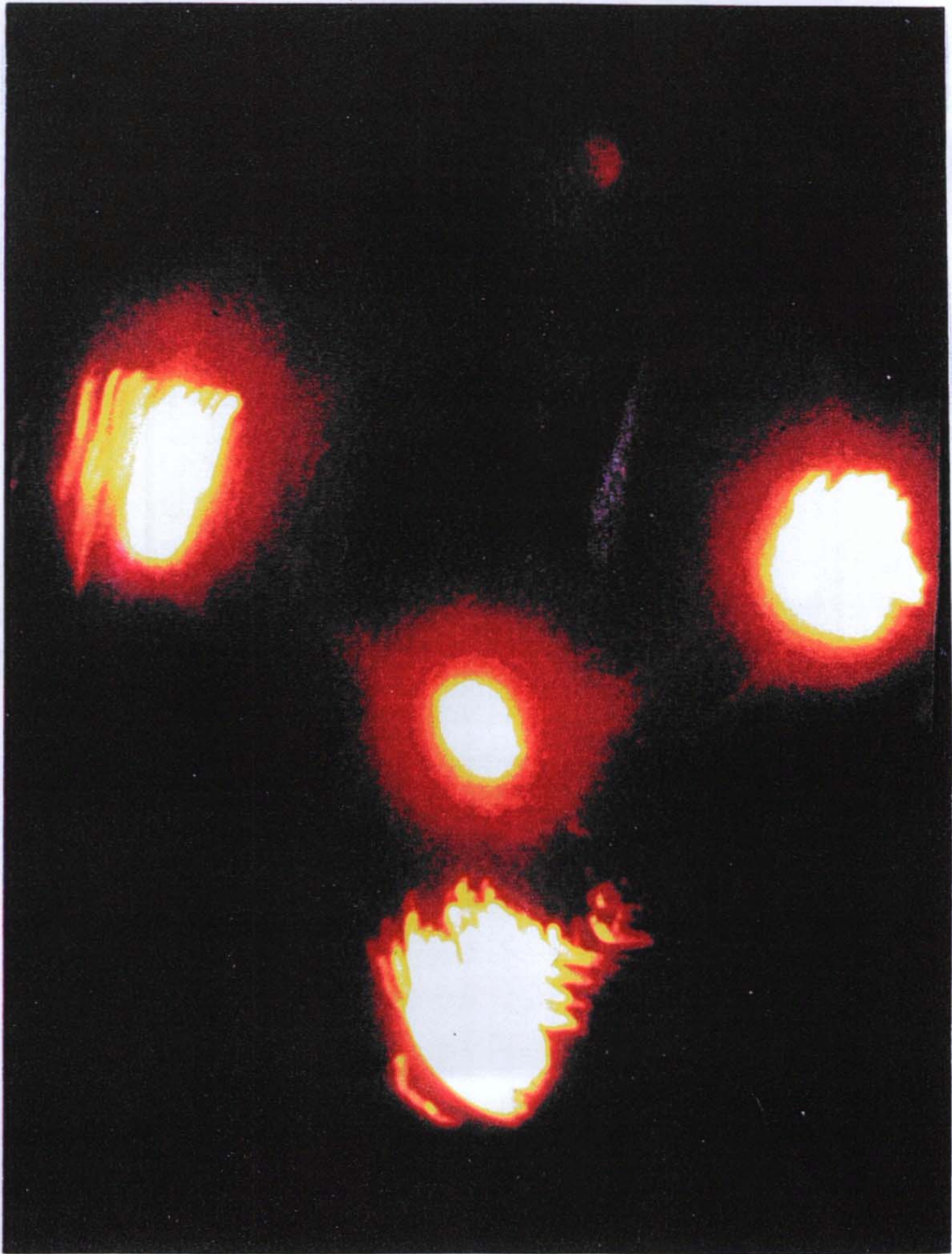
AN EXAMPLE UAP FORMATION OF THE TRIANGULAR TYPE